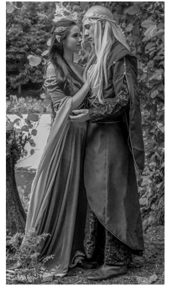
Vencia & Faberio

Will Consort Faberio soon be Mr. Empress Vencia Sailatar? Sources tell us at the Mirror that Faberio was recently seen wearing a white cloak - perhaps THE white cloak? The Dragon Cloak of House Sailatar - symbol of the Imperial line for time immemorial. The Dragon Cloak was gifted to the Sailatars by the Dragon Kurokami when the house was established and would be a sensational addition to Faberio's already impressive wardrobe, and just in time for winter, too!