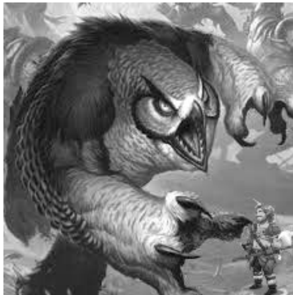
Myrinath's Monsterous Melee

The bout was quick but intense. Otis got in a few solid hits, but it wasn't enough to stem Arry's FURIOUS ONSLAUGHT. Arry connected on three blows for every one Otis managed to land, and while not much can stand up to one of Otis's haymakers, Arry